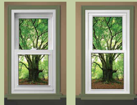
VINYL VS. RESTORATIONS WINDOW

The Restorations Full-Frame Replacement System takes replacing old windows a step further, thoroughly restoring the structural integrity of the window opening while installing an energy efficient, low-maintenance replacement window.